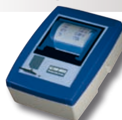
Thermal printer with memory card