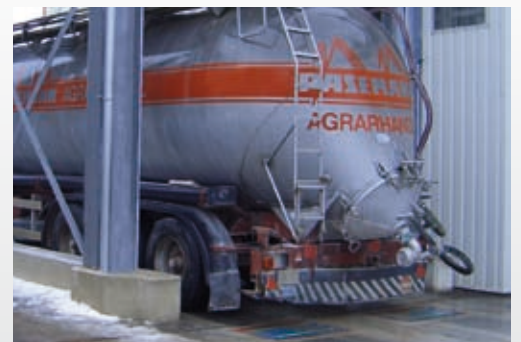
WWS installed flush floor, for dynamic weighing >>