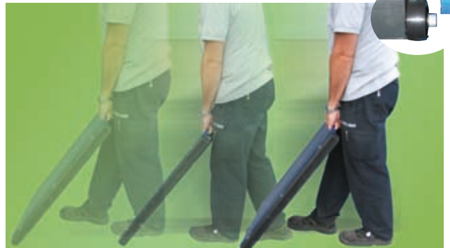
WWSD / WWSE