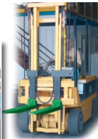
Weighing forks for lift trucks