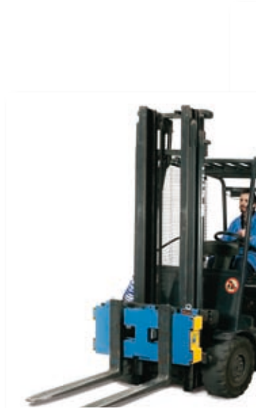
Weighing modules for lift truck

The range of Dini Argeo products for logistics weighing includes also: