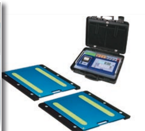
Vehicle weighing platforms