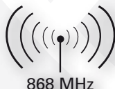
868 MHz Radio Frequency