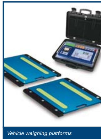
Vehicle weighing platforms