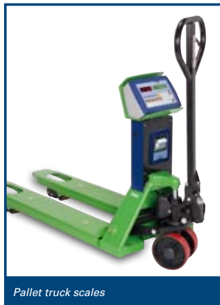
Pallet truck scales