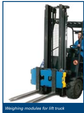
Weighing modules for lift truck

The range of Dini Argeo products includes also: